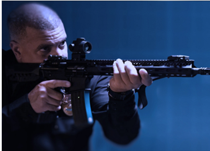
Officers will be immersed in a state-of-the-art simulator, which portrays real-life scenarios.