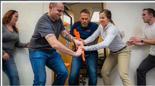
Active Violence Response Training

Unlike other training programs that focus solely on Run, Hide, Fight techniques. AVERT uses an active training method to teach awareness, how to react in a violent situation, and how to respond to severe injuries that are often a result of these occurrences.