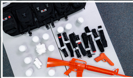
Instructor Training Kit