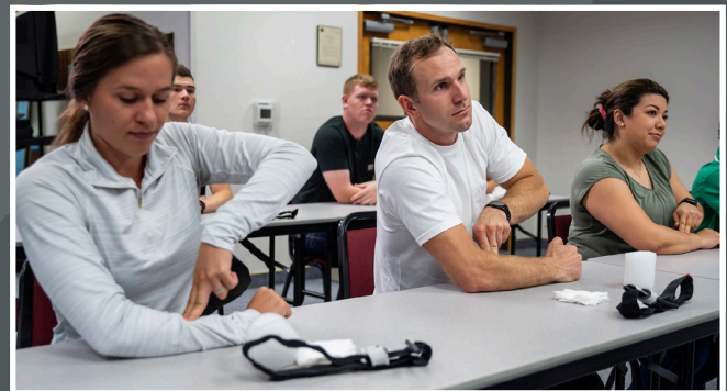
Bleeding Control Practice

GO BEYOND ACTIVE SHOOTER RESPONSE TRAINING