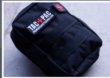
Emergency TAC+PAC Kit