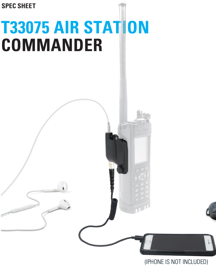
(IPHONE IS NOT INCLUDED)