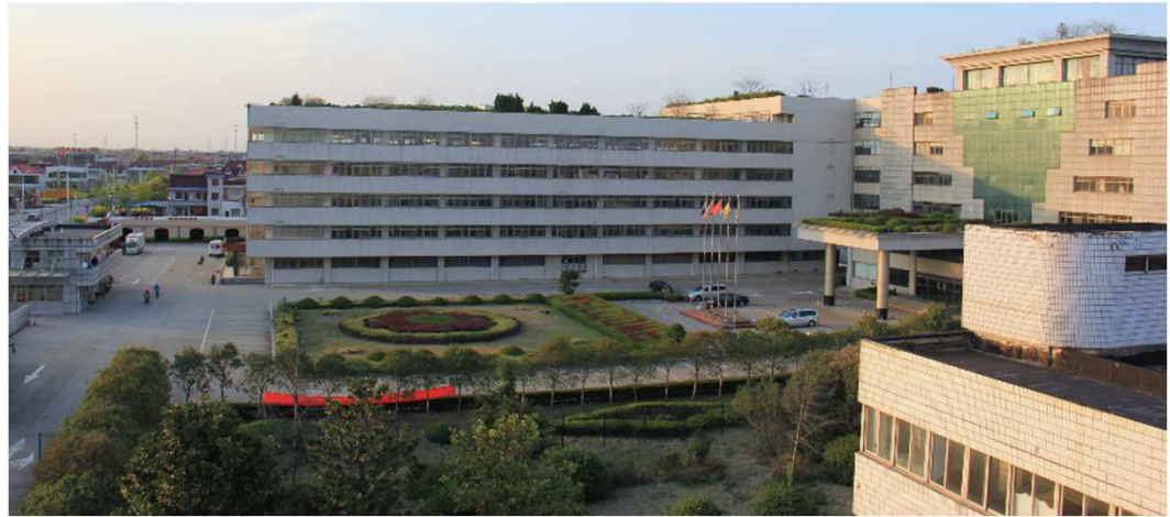
Inside the factory