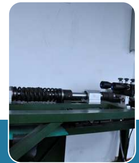
Shock Table 2 pcs