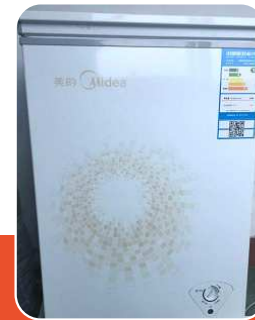
Refrigerator 1 pcs