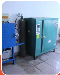
Nitrogen Filing 2 pcs