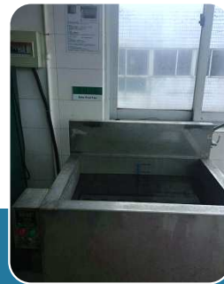
Water Sink 1 pcs