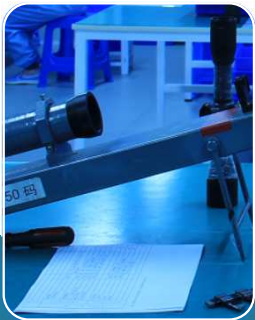
Collimator 40 pcs