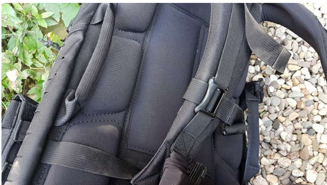
Side handles on back enable easy pickup.