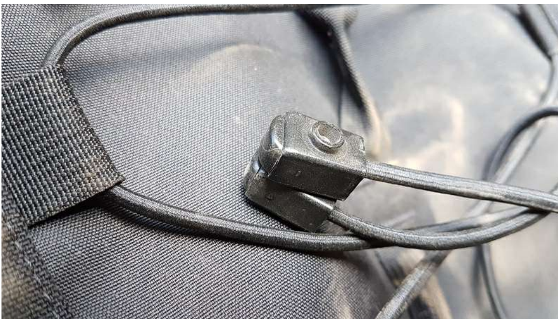
Absolutely loved the snap together bungee cord "buckles."