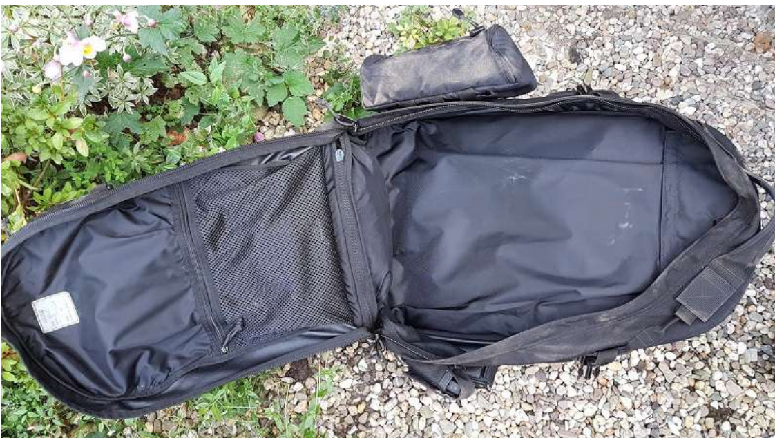
The front loader clamshell for easy access to stowed gear.