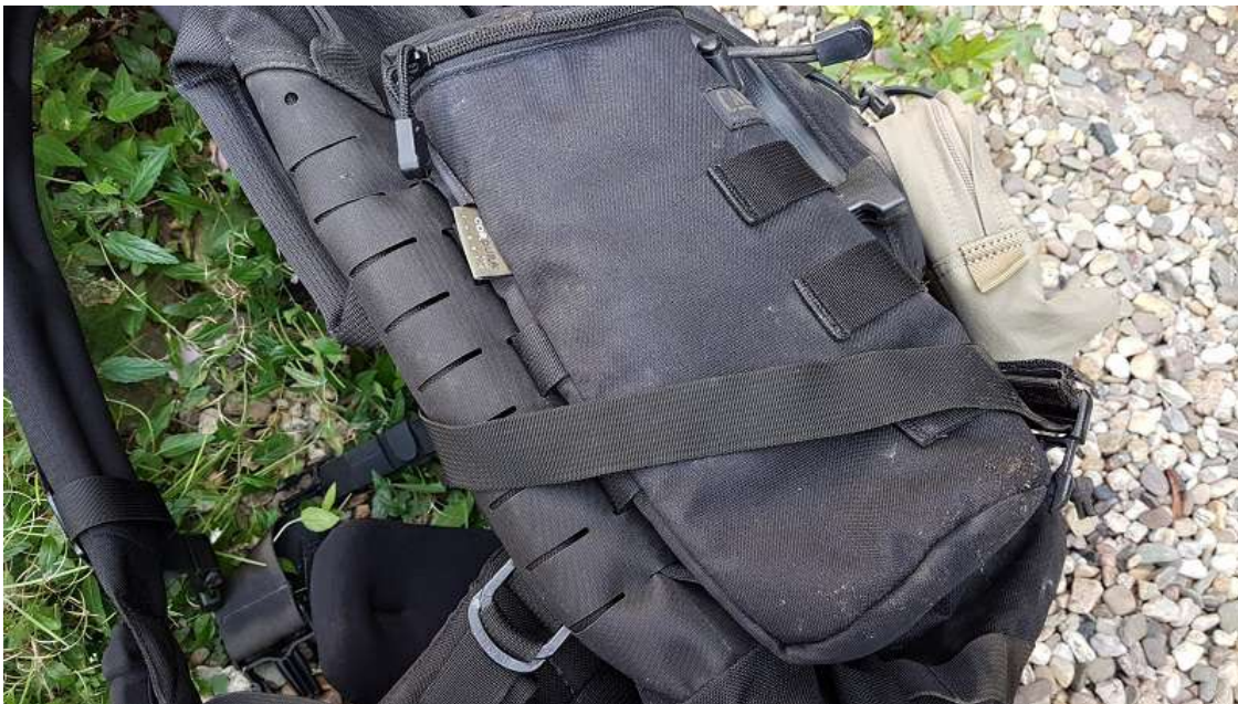
The laser cut MOLLE make sure you can add whatever you need to the bag. These can be found on front and the sides of the backpack.

Adjustable waist straps make the backpack adaptable for taller people. Designed with three MOLLE rows, the WDA securely sits on the bottom of the pack until you choose to disconnect it. The WDA keeps the tactical backpack attached on position while moving roughly. Spine reinforcement features an anatomically shaped back plate and two aluminium reinforcement bars on each side.