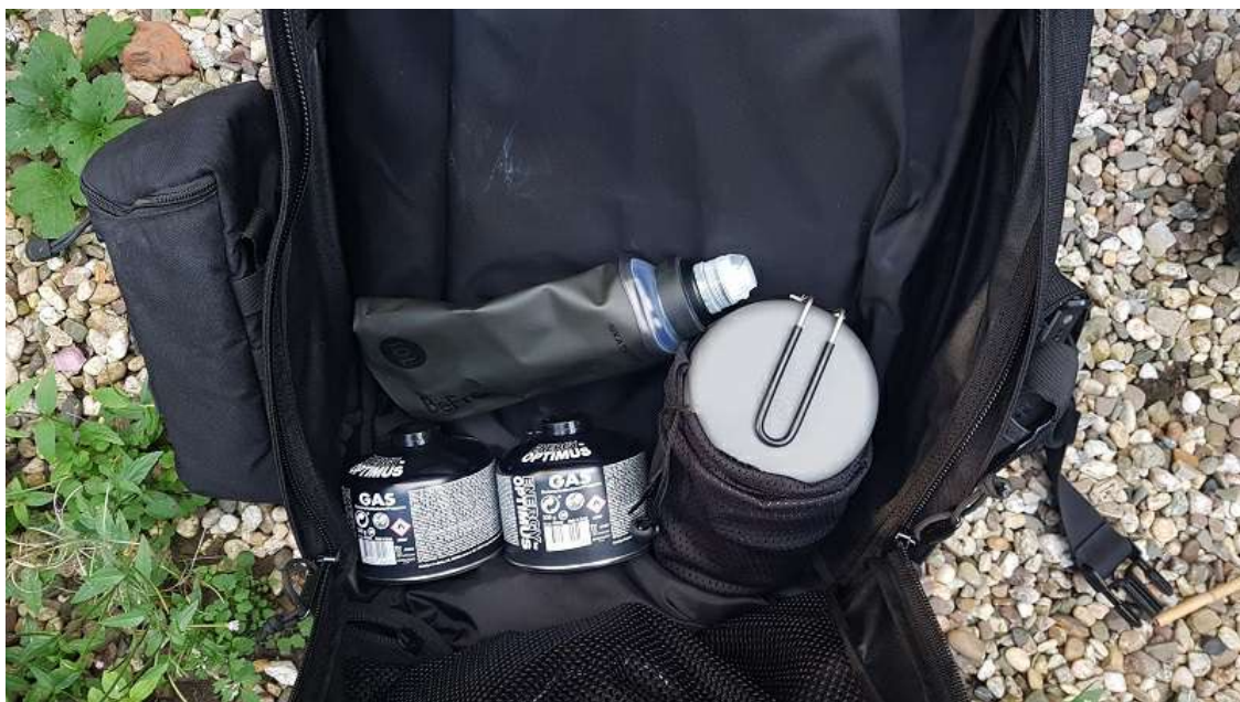
It features enough room for everything you need for a long trip.