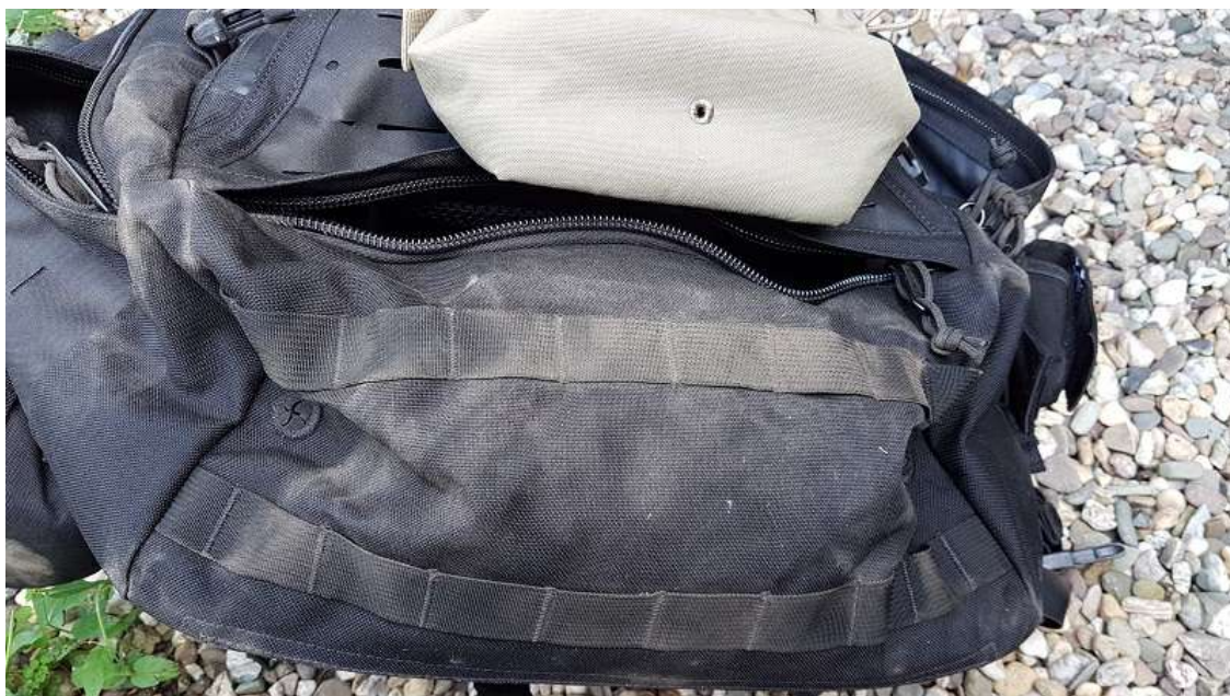
The bottom zipper provides easy access to gear stowed further down.