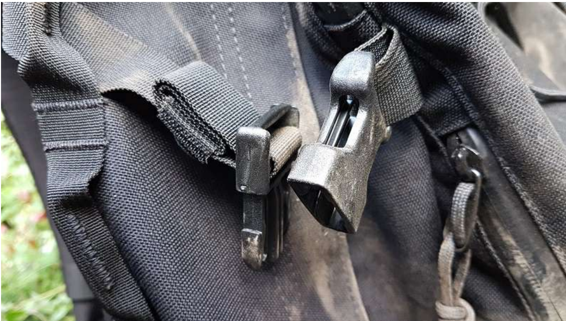
The M-1045 features built-in ITW-North America Nexus GhilleTex buckles.