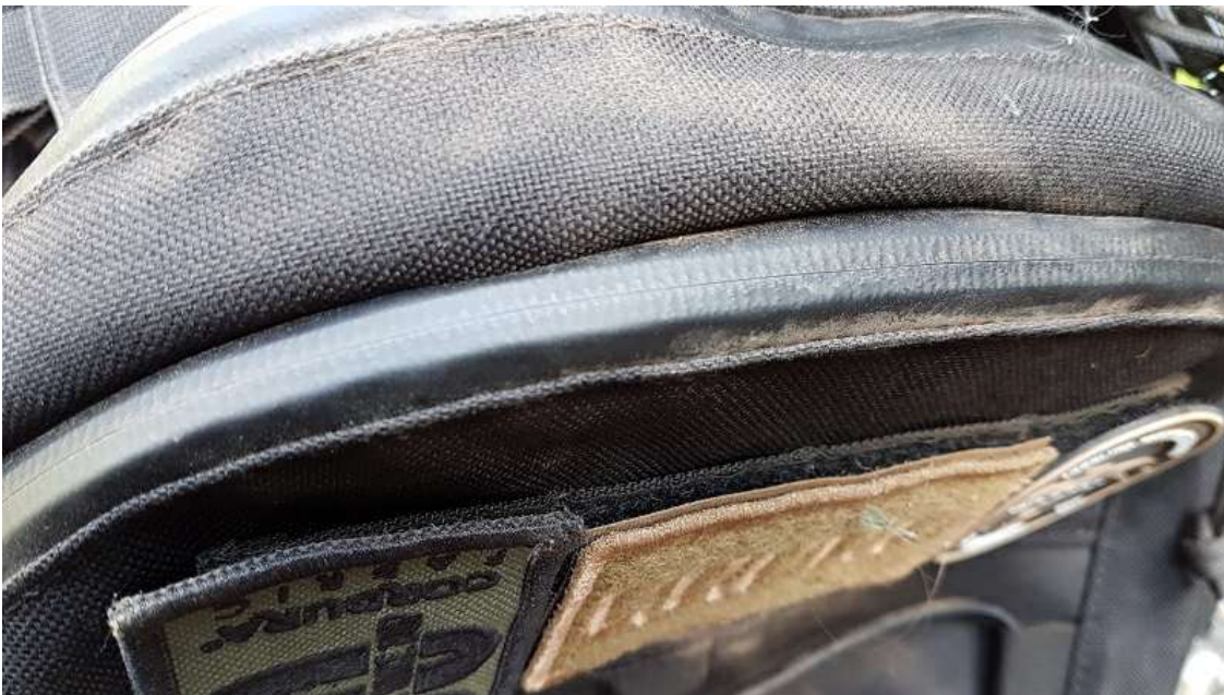
Water resistant zippers and water resistant interiors keep your gear dry.

The front compartment has a water resistant zipper and a water resistant interior and through the two side zippers (left and right) one can access another compartment that can be accessed from either side.