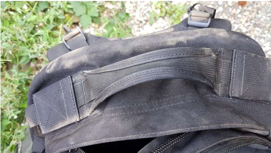
The heavy-duty carry and drag handle is quite tough and enables rough dragging.

The front compartment has a water resistant zipper and a water resistant interior and through the two side zippers (left and right) one can access another compartment that can be accessed from either side.