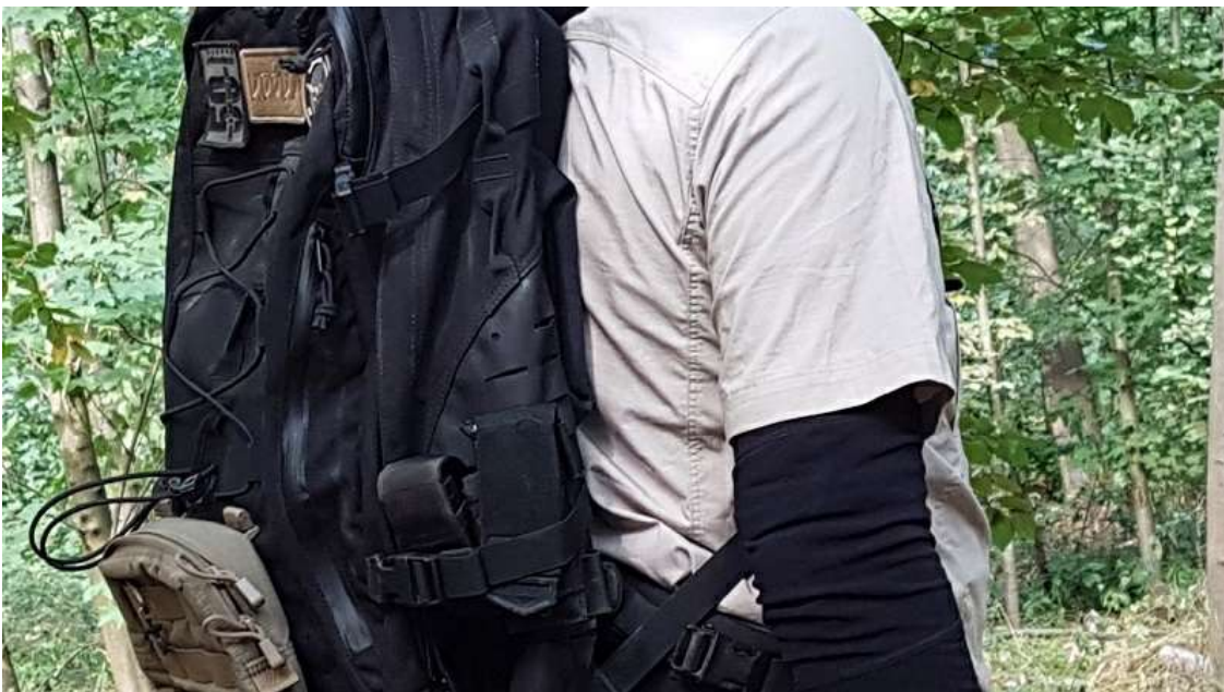
Four compression straps keep the load tight, securing the main compartment and do not allow the bag to look bulky.