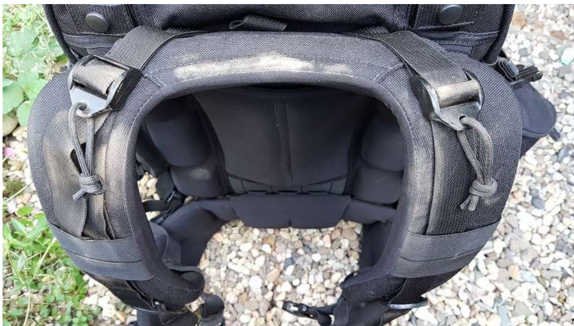
Very thick shoulder straps to ensure comfort.

The shoulder straps are very thick to ensure the user's comfort even when the bag is very heavy and full of gear. The front of the straps is well-matched for horizontal clip-ons, straps, D-Rings and weight distribution straps. The shoulder straps are also modifiable, and the right shoulder strap comes with an ingenious quick release feature that can be instantly discharged in case of an emergency situation. I feared this would be triggered when in the field, which for two days it did not! At the end of this article there's a short video demonstrating this.