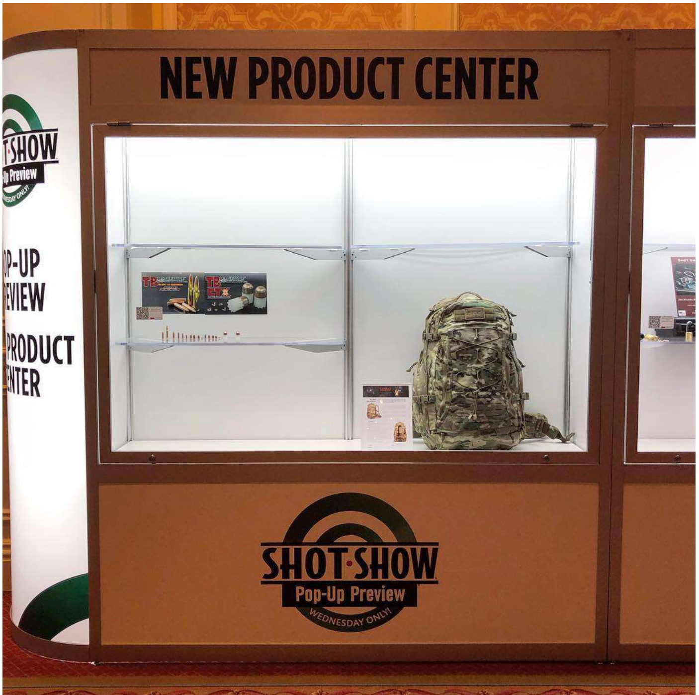
KROKO Tacticals gear during SHOT Show Pop-Up Preview 2019, booth W1514.