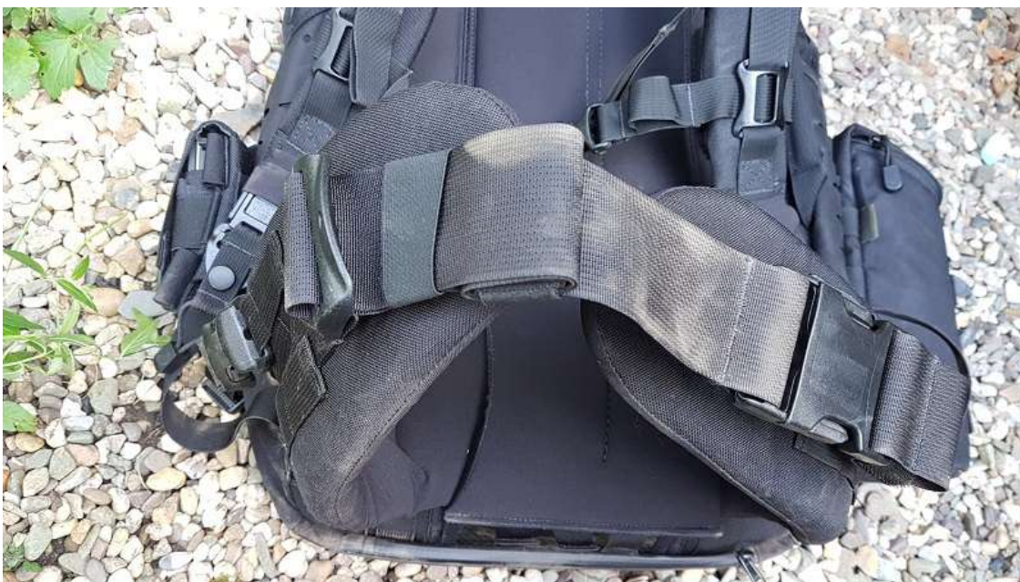
Kroko Tactical Weight Distribution Adapter (WDA), part of Kroko's weight distribution system, is easily detachable via an ingenious MOLLE system. See below for photos: