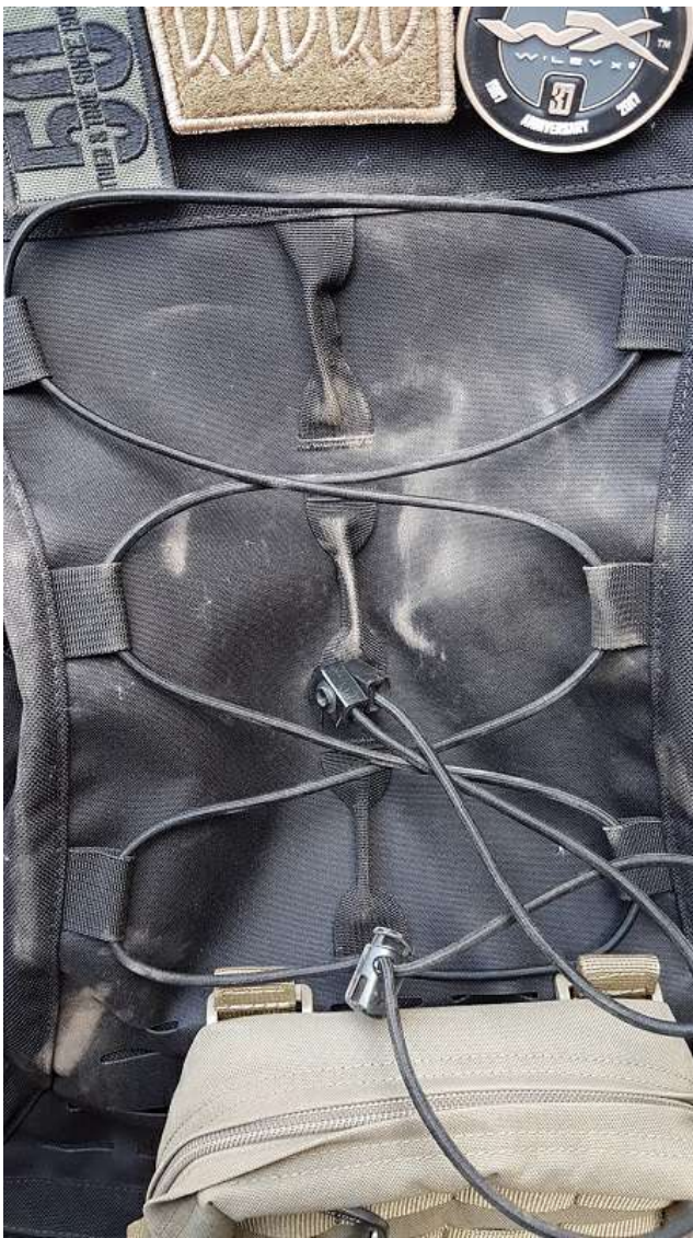
The bungee cord in the front is excellent for storing your helmet.