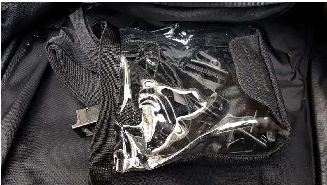
The M-1045 comes with a field repair kit that includes various belts and buckles. Now that is what I call customer support.

While using this backpack, I did not have one single complaint. It is a merge of all expectations I ever had. This amazing tactical backpack can be used for three days, assisting you for 72 hours.