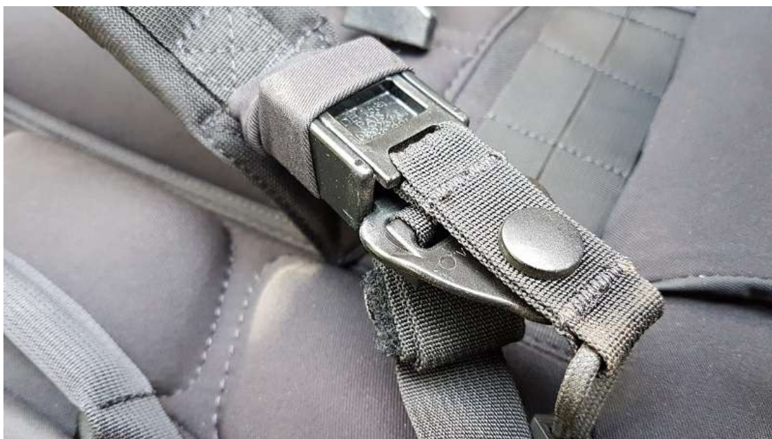
The right shoulder strap comes with an ingenious quick release feature.