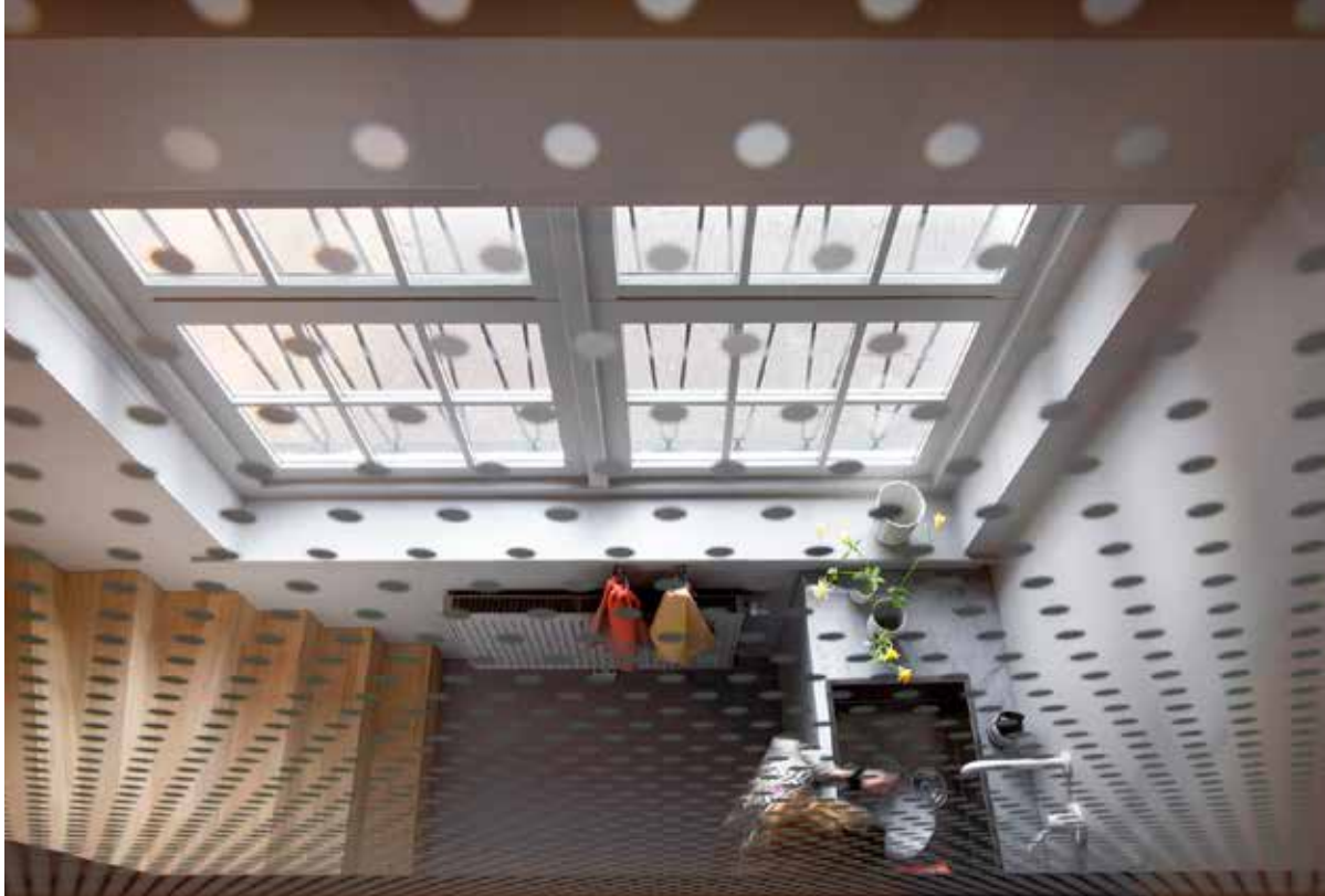
Arita House Amsterdam / Photographer: Inga Powilleit

Coinciding with NeoCon 2016, Skyline Design presents Glass Gradients, a family of etched and printed patterns for glass application created by Dutch designers Scholten & Baijings. Playing with two basic geometric forms, a dot and a square, the designer pair evolves patterning by combining elements of transparency, variable gradients, and color transitions. The resulting custom landscapes can be restrained or exuberant, matching or distinctive. The new collection marks the first collaboration between Skyline Design and Scholten & Baijings.