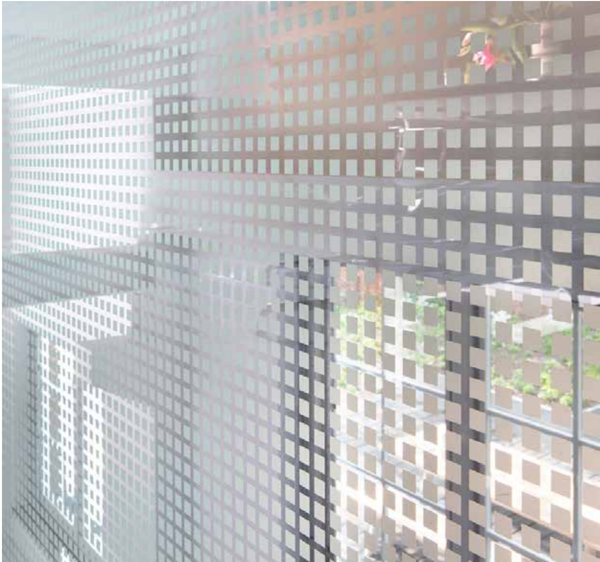
Arita House Amsterdam