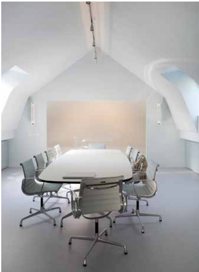
Arita House Amsterdam

Industrial clients include Maharam, HAY, IKEA, Karimoku New Standard, Georg Jensen, 1616 / Arita Japan, Moooi, Thomas Eyck and MINI.