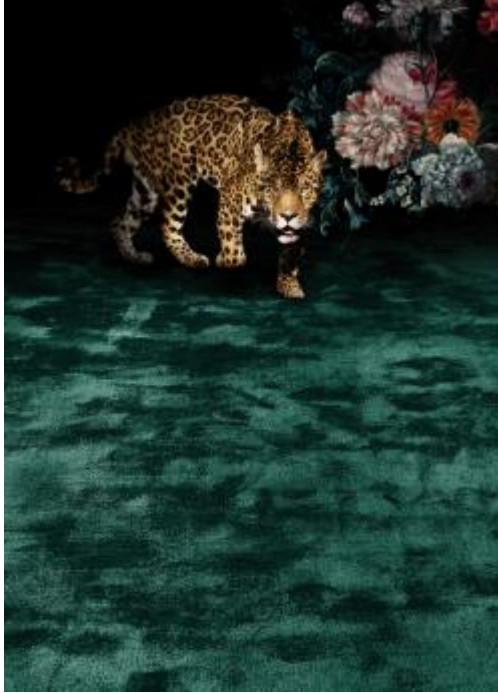
Image PURE SILK, colour 2508 malachite