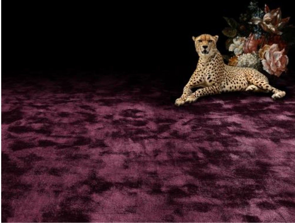
Image PURE SILK, colour 2523 ruby