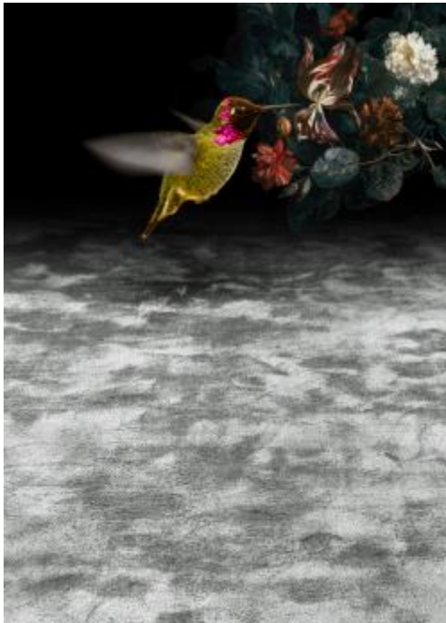
Image PURE SILK, colour 2518 silver