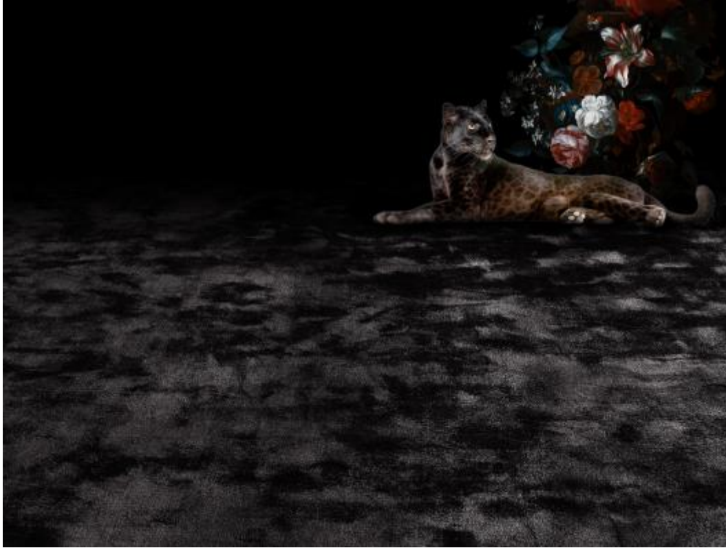
Image PURE SILK, colour 2520 onyx