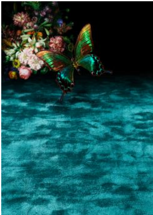
Image PURE SILK, colour 2507 azure