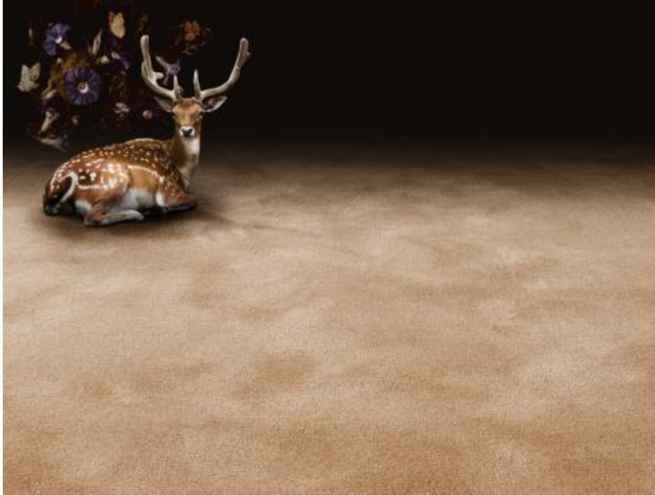
Image PURE WOOL, colour 2605 sand