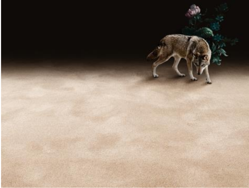
Image PURE WOOL, colour 2603 windflower