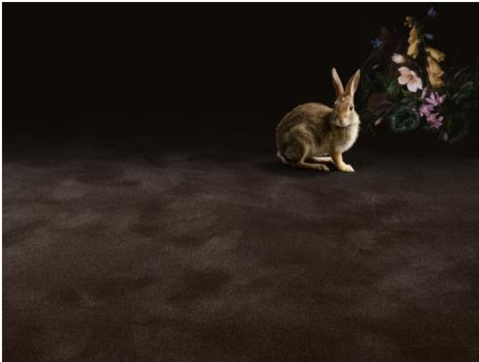
Image PURE WOOL, colour 2613 wolf