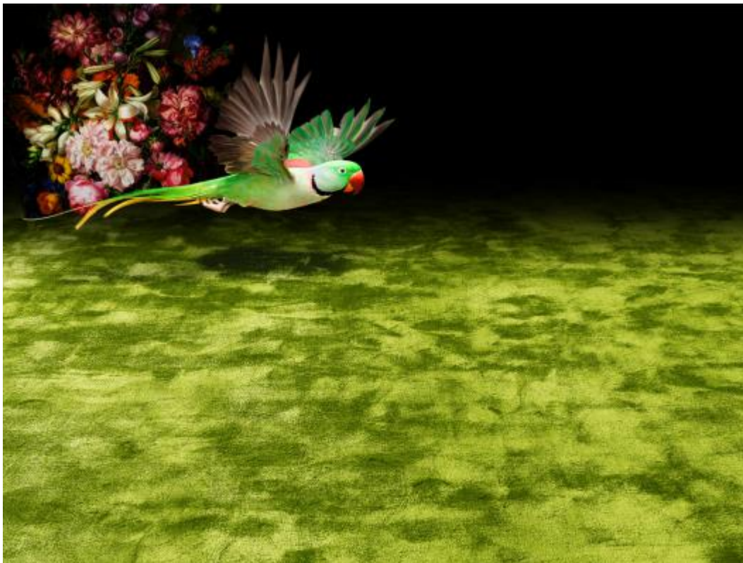
Image PURE SILK, colour 2510 jungle