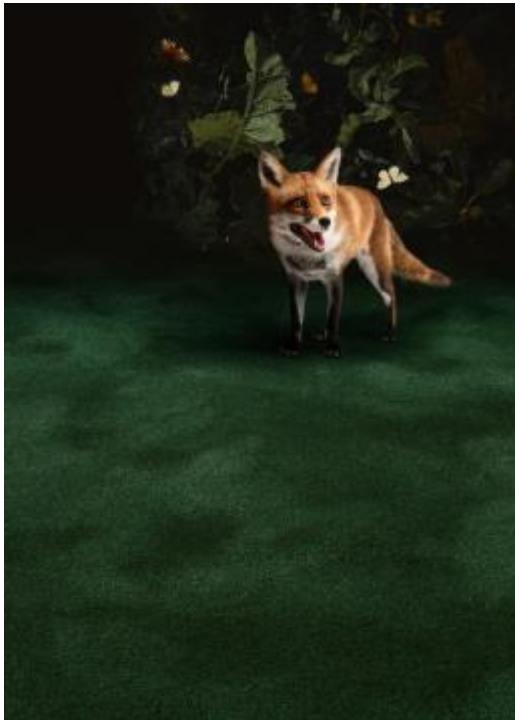
Image PURE WOOL, colour 2610 forest