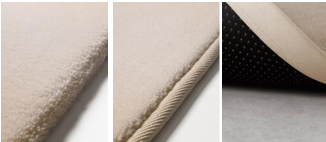
PURE WOOL images with special made and bordered RUGX-Carpets as well as BlackThermo®Felt backing with non-slippery naps (left to right)