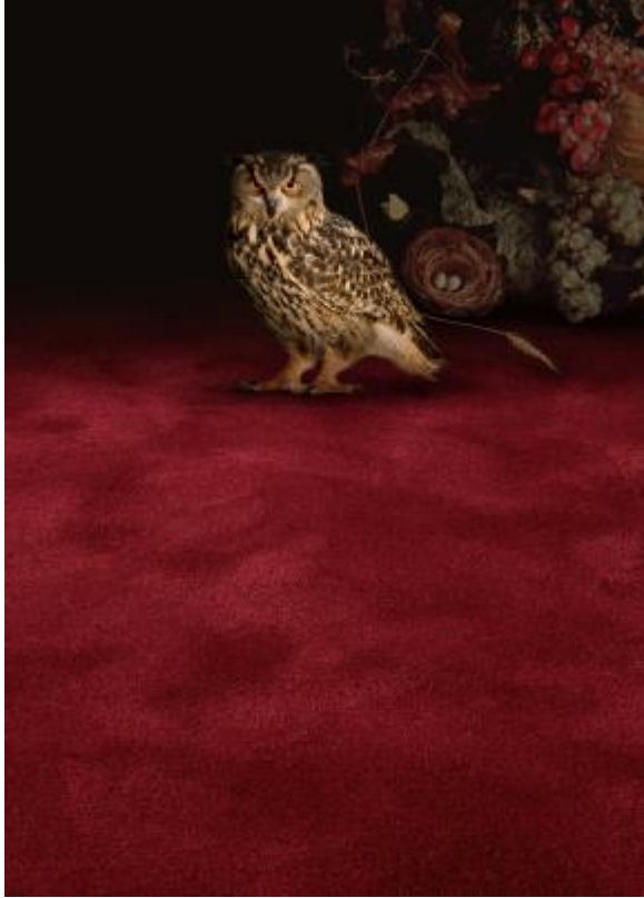
Image PURE WOOL, colour 2616 berry