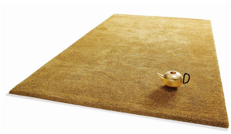
RUGX Carpet SMOOZY, Color 1610 Curry (Free form photo without prop available upon request)