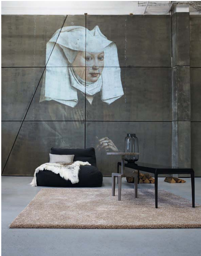
RUGX Carpet SMOOZY, Color 1603 Sand