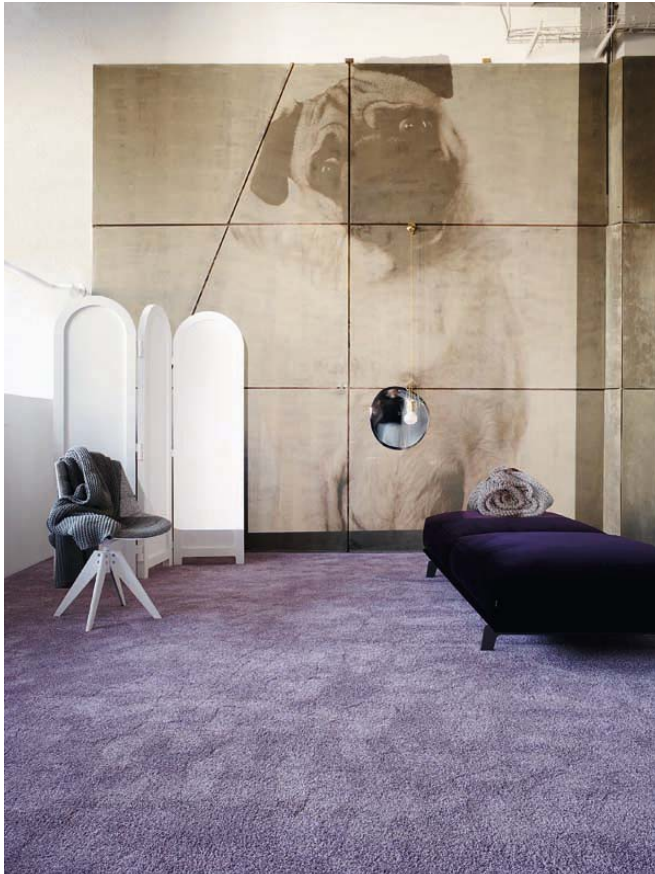
SMOOZY Fitted Carpet 1609 Lilac