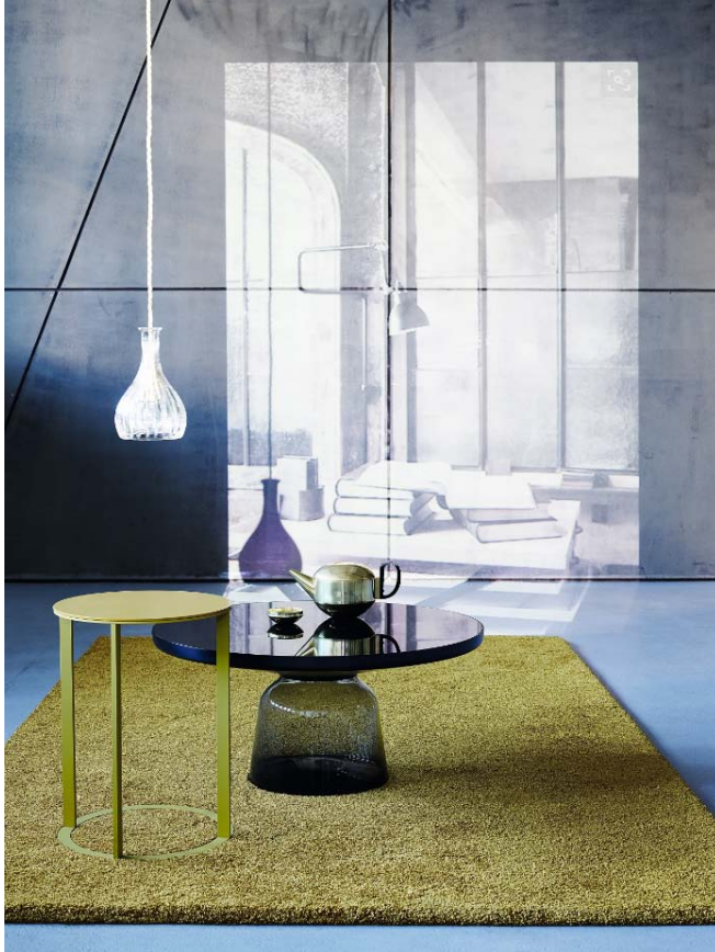
RUGX Carpet SMOOZY, Color 1610 Curry