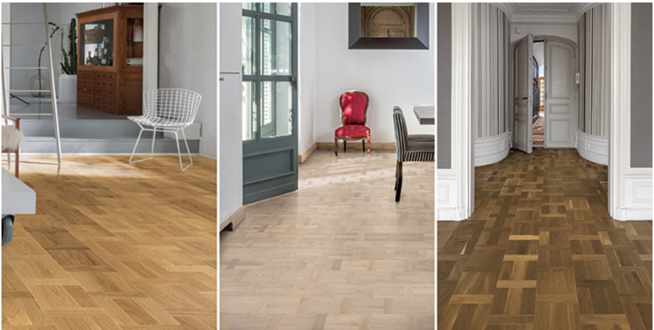
Palazzo Rovere, Palazzo Bianco, Palazzo Fumo