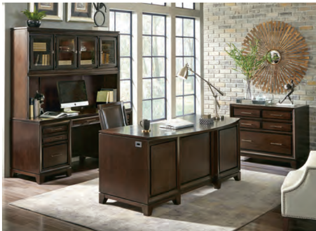
74" CREDENZA & HUTCH, 72" CURVED-TOP EXEC. DESK & COMBO FILE 173-318/319/378/300T/B & 366A