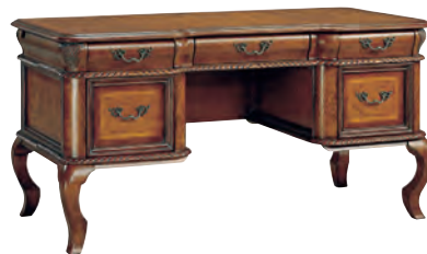
60" WRITING DESK 174-60WD