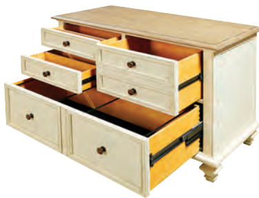
COMBO FILE CABINET 167-378