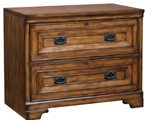
LATERAL FILE 149-331