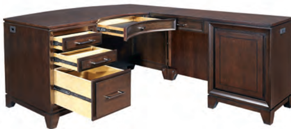
DESK AND RETURN 173-307/308