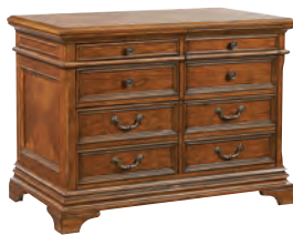
LATERAL FILE CABINET 126-378