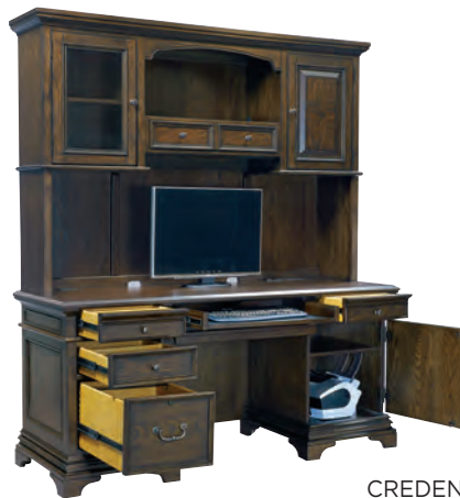
CREDENZA AND HUTCH I24-316/317