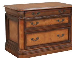
LATERAL FILE 174-331