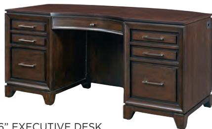
66" EXECUTIVE DESK 173-303