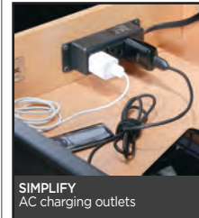
SIMPLIFY AC charging outlets

aspenhome's products include innovative and useful features to make consumers' lives easier, adding value for our retailers.