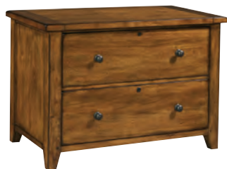
LATERAL FILE IMR-331