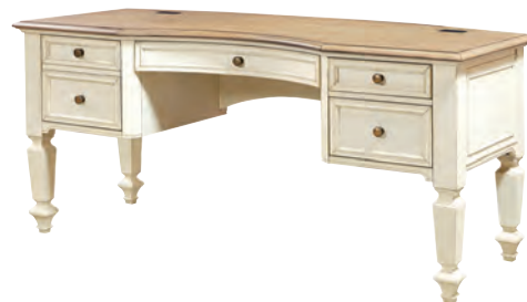
66" CURVED-TOP HALF PED DESK 167-371