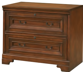
LATERAL FILE 140-331