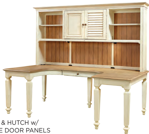
84" U DESK & HUTCH w/ REVERSIBLE DOOR PANELS 167-385/380H