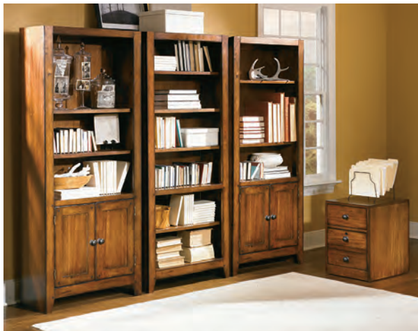
BOOKCASE WALL w/ ROLLING FILE CABINET IMR-332/333/332/3046