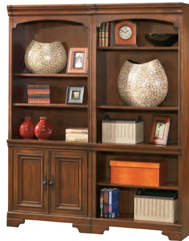
BOOKCASE WALL 140-332/333