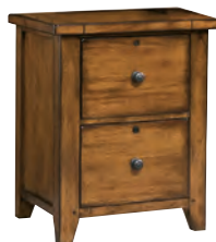
TWO DRAWER MODULAR FILE IMR-3024