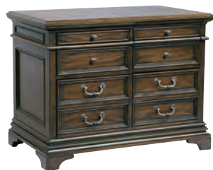
LATERAL FILE CABINET I24-378