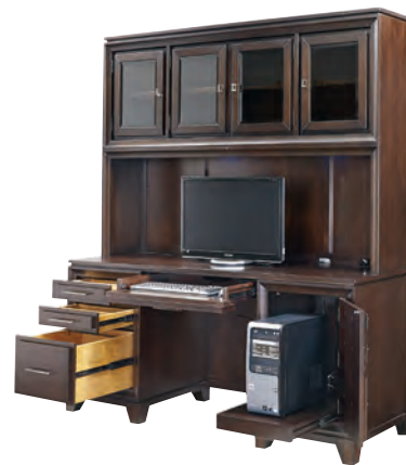
66" CREDENZA AND HUTCH 173-316/317