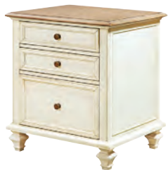
SINGLE FILE CABINET 167-379