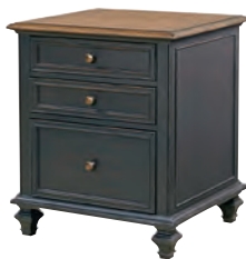
SINGLE FILE CABINET 165-379