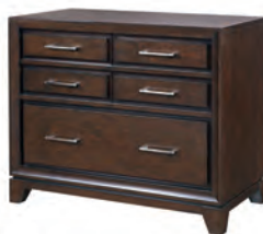
LATERAL FILE CABINET 173-378