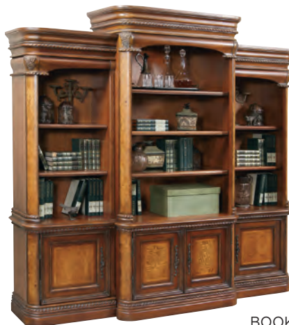
BOOKCASE WALL 174-334/335/336