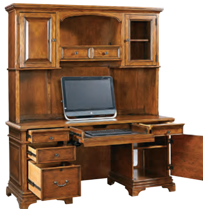
66" CREDENZA AND HUTCH 126-316/317