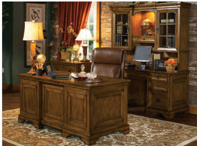
EXECUTIVE DESK 149-303