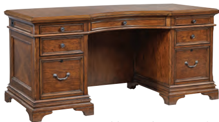
66" EXECUTIVE DESK 126-303