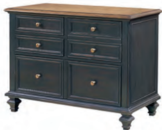
COMBO FILE CABINET 165-378