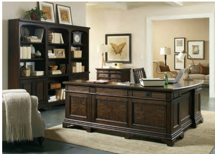
DESK w/ REVERSIBLE RETURN I24-307/308