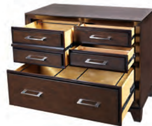
LATERAL FILE CABINET 173-378