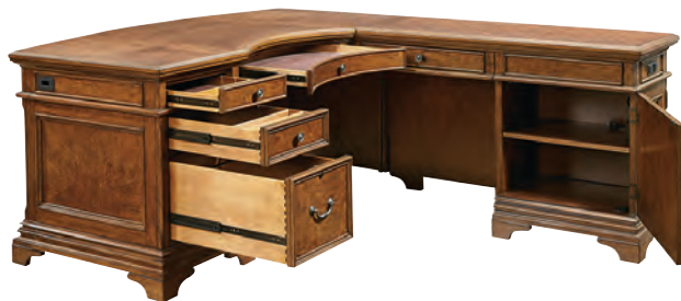
DESK AND RETURN SHOWING RETURN REVERSED 126-307/308