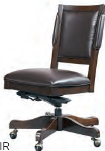
OFFICE CHAIR 173-366