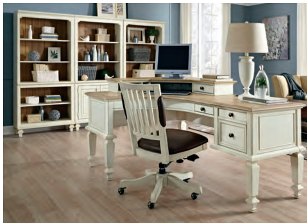
CURVED HALF PED L DESK w/ CORNER HUTCH AND OFFICE CHAIR 167-372/370CH/366