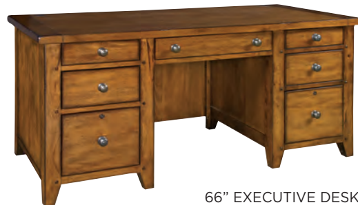
66" EXECUTIVE DESK IMR-303