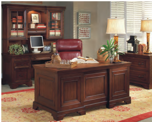
66" EXECUTIVE DESK 140-303