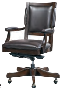
OFFICE ARM CHAIR 173-366A