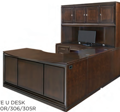
EXECUTIVE U DESK 173-319/320R/306/305R