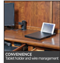
CONVENIENCE Tablet holder and wire management