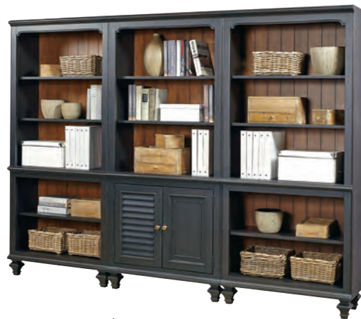
BOOKCASE WALL w/ REVERSIBLE DOOR PANELS 165-333/332/333