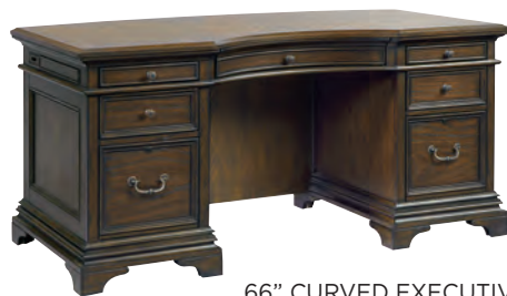
66" CURVED EXECUTIVE DESK I24-303