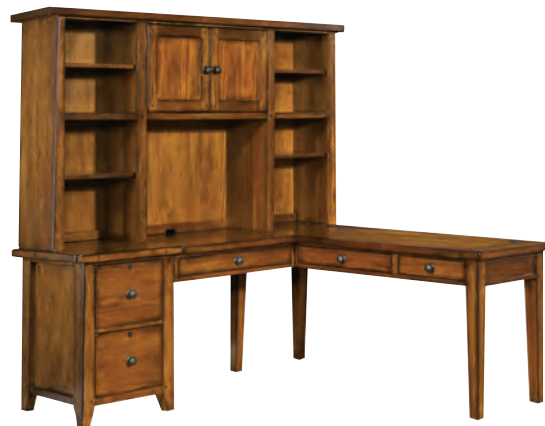
MODULAR DESK WALL IMR-3078/3064/3030/3024