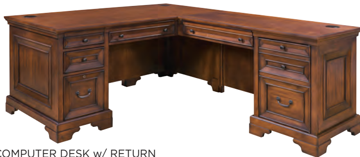
COMPUTER DESK w/ RETURN 140-307/308