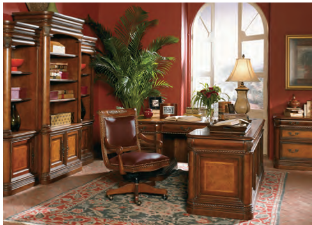
DESK AND RETURN w/ OFFICE CHAIR 174-305/306/L74-269963