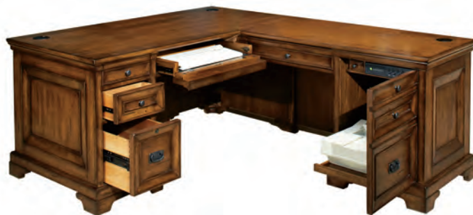
72" COMPUTER DESK WITH RETURN 149-307/308