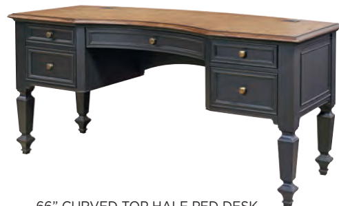
66" CURVED-TOP HALF PED DESK 165-371