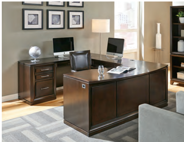
EXECUTIVE U DESK w/o HUTCH 173-305R/306/320R