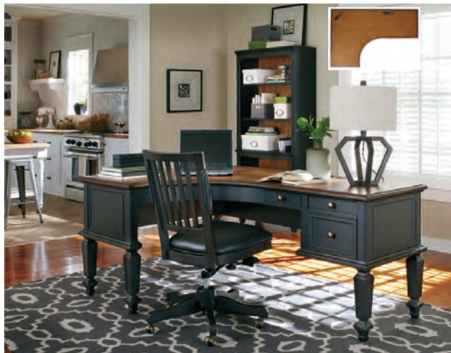
CURVED HALF PED L DESK w/ OFFICE CHAIR 165-372/366