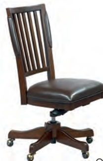
OFFICE CHAIR I24-366