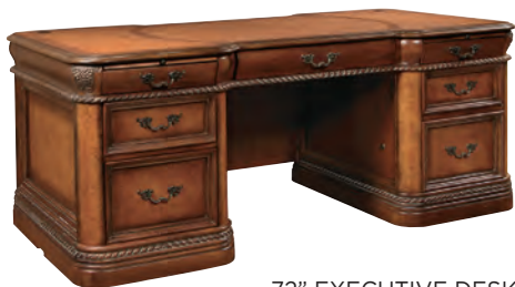
72" EXECUTIVE DESK 174-300B/300T