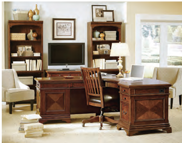
DESK AND RETURN w/ OFFICE CHAIR 126-307/308/366