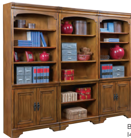
BOOKCASE WALL 149-332/333/332